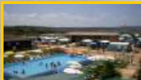
Pool on the campsite

Some of the facilities available onsite are: Mini-market, Mini Soccer pitch, games room and an outdoor pool with sun lounges for you to relax comfortably under the umbrella.