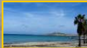
Beaches just 5 and 20 mins walk